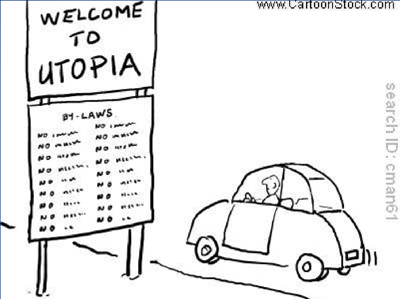
Picture 2: What is the creator of this image satirizing? What is the humor behind the image?